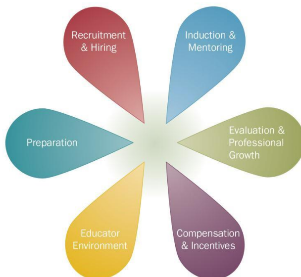
Figure 1: Talent Management. This figure depicts the systems that develop and support educators.

Similar to all professionals, U.S. Virgin Islands Department of Education (VIDE) coordinators need evidence-based feedback and professional supports to continue to grow in their positions. Research has associated these types of supports with increased job satisfaction, retention, and performance improvement. Current efforts to improve educational administrators recognize the importance of managing talent across the career continuum. Managing educator talent requires coherence among systems that wrap around and support educators (see Figure 1) and coordination between districts, departments of education, leader preparation programs, and other entities (Behrstock-Sherratt, Meyer, Potemski, & Wraight, 2013).